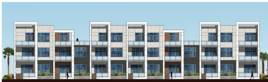
REAR ELEVATION | RINGLING BLVD.