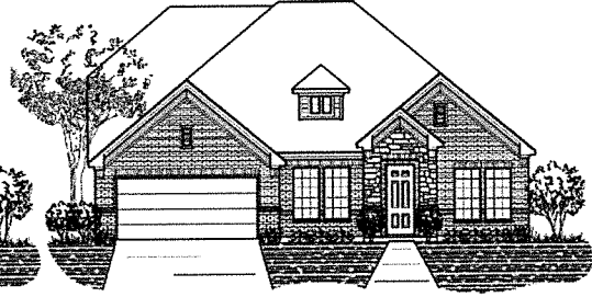
ELEVATION 'A' - STONE