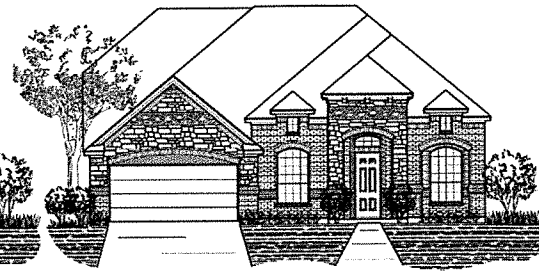
ELEVATION 'C' - STONE