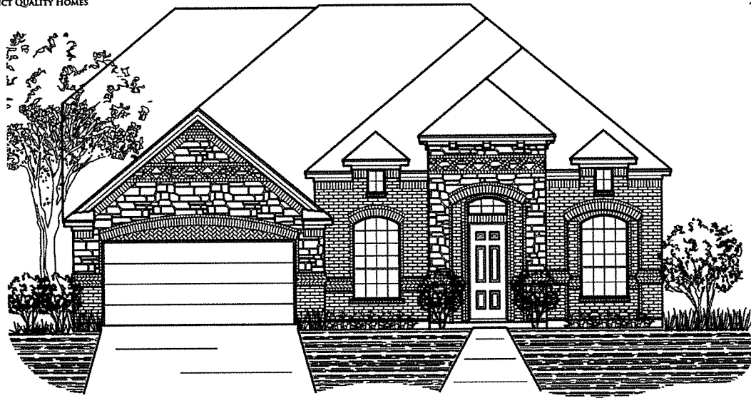
ELEVATION 'C' - STONE