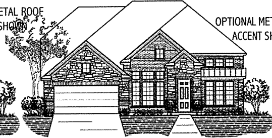
ELEVATION 'B' - STONE