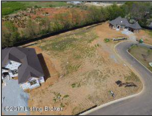
Cul de sac lot with sidewalks