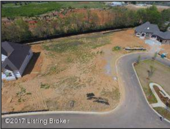
Cal de sac lot