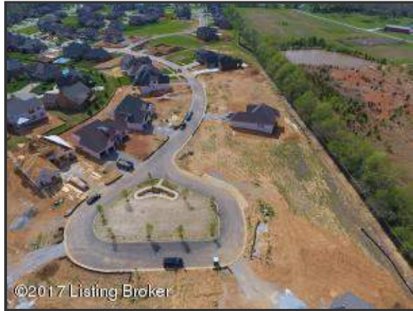
Cul de sac lot