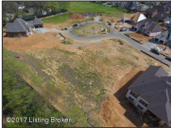
Plenty of space!