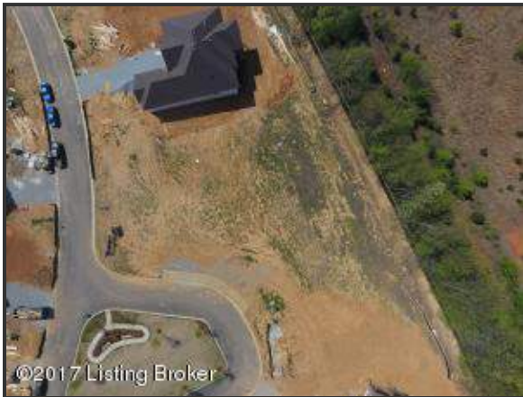
Flat, walkout lot