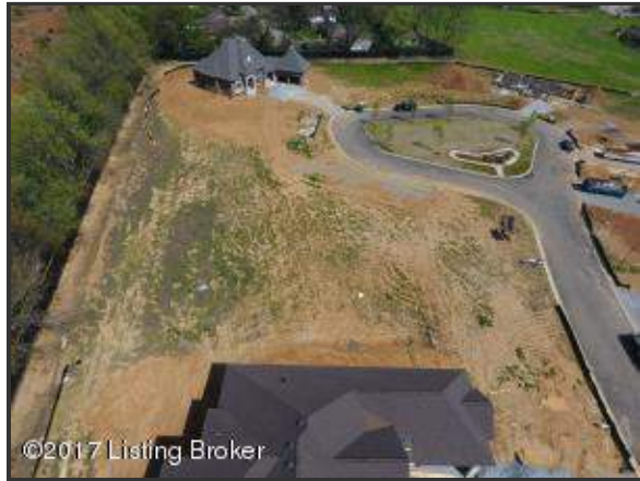
Plenty of space!