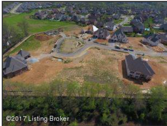
View from rear of property