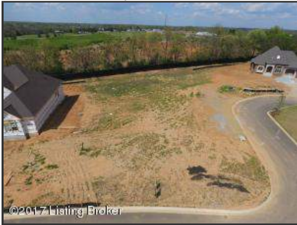
Plenty of space on this .36 Acre Lot