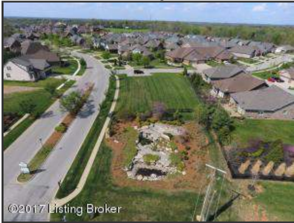
River Rock Neighborhood