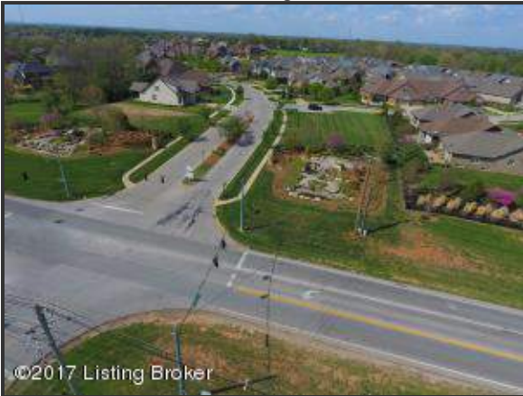
River Rock Neighborhood