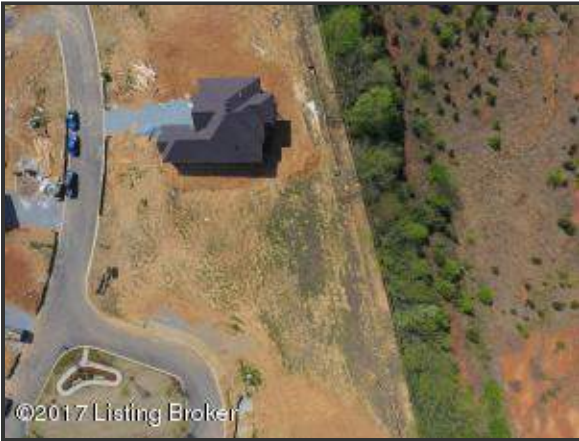
Tucked on a quiet cul de sac