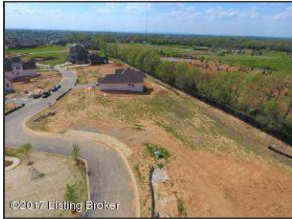
Perfect place for our new home!