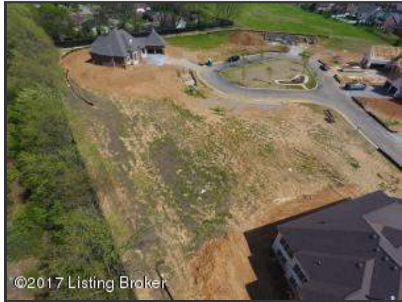
View from rear of property