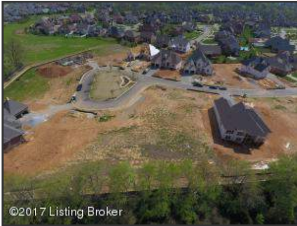
View from rear line of property