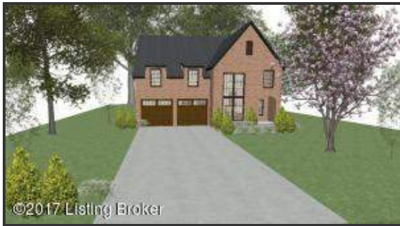
Proposed Rendering of Front Elevation