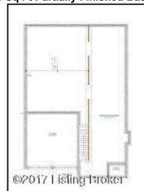
Home's Floor Plan of Partially Finished Basement