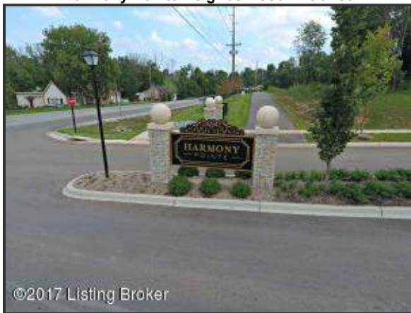
Located at the intersection of Hwy 42 and 1793 in North Oldham.