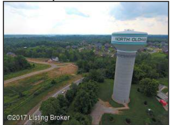
Districted for Harmony Elementary, North Oldham Middle, and North Oldham High School