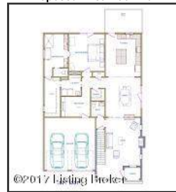
Home's First Floor Plan