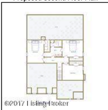
Home's Second Floor Plan