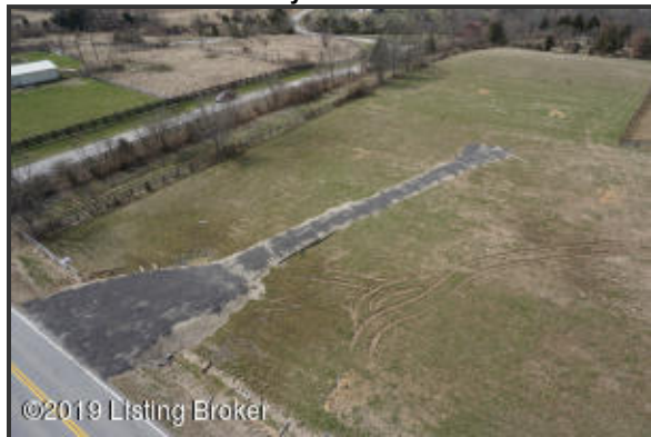
Perfect for your dream home!