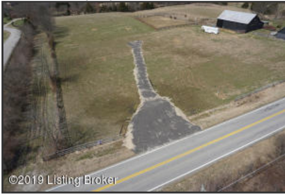
Ample space for custom home