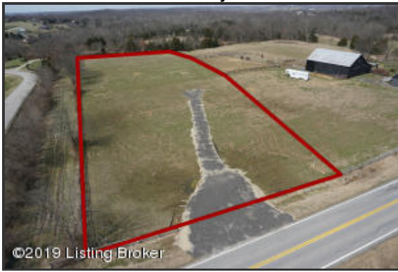
3151 E Hwy 146