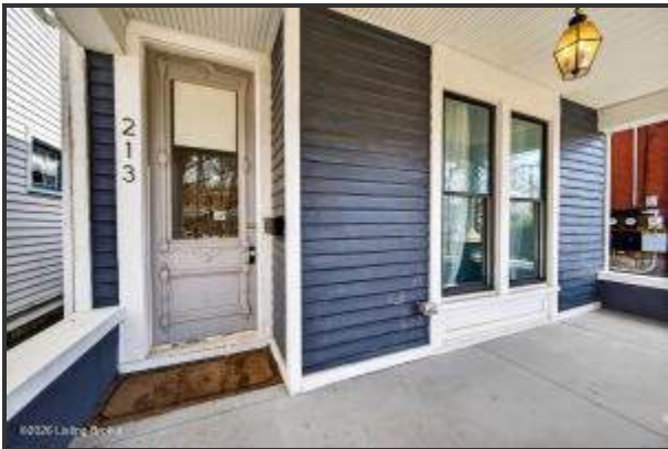
The ornate original front door features carved detailing and a glass panel