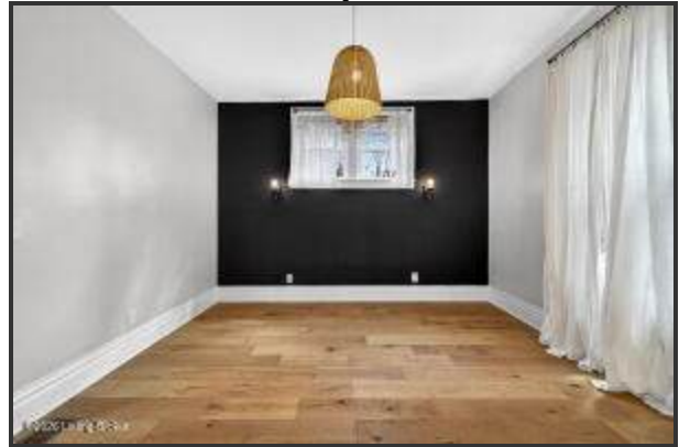
A black accent wall with flanking wall sconces sets a sophisticated tone