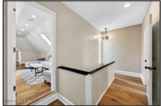
The second floor is home to 2 additional rooms and a full bath