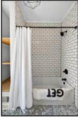
The tub and shower combo features floor-to-ceiling white subway tile