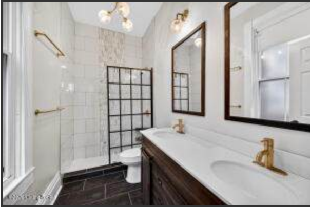
The ensuite bath highlights a double vanity with dark wood cabinetry, a quartz countertop, dual sinks, and a gorgeous walk-in shower