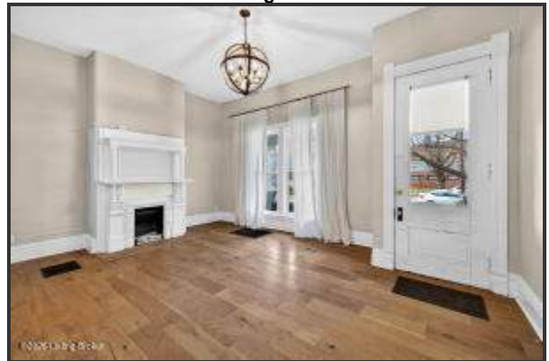
Wide-plank hardwood floors welcome you inside and run throughout the home