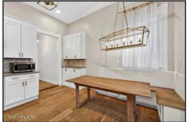
A built-in dining nook with wood bench seating is both charming and functional