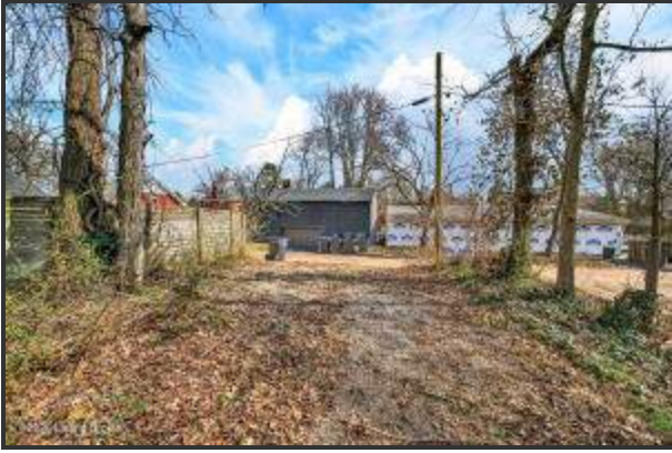
The generous lot depth offers excellent potential for entertaining, gardening, or play