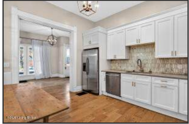
Stainless-steel appliances - including a French door refrigerator, gas range, dishwasher, and built-in microwave - convey with the property