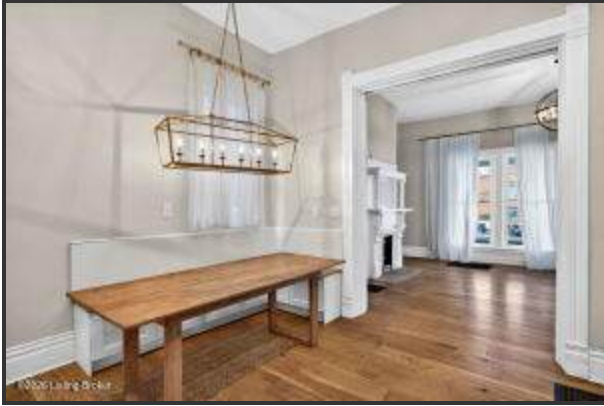
Gold lantern pendant lighting illuminates the dining area and kitchen