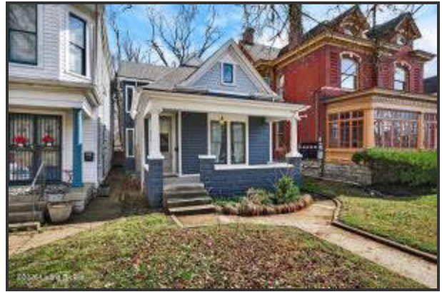
Beautifully renovated historic home