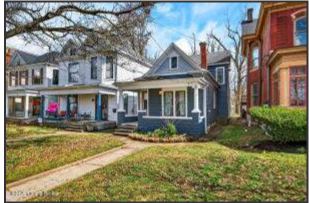
Classic architecture features blue lap siding, fish-scale shingle gable detail, and crisp white trim