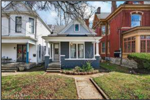
Located in the highly sought after Clifton neighborhood