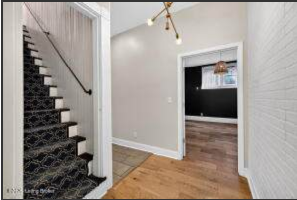
The stairway is located near the primary suite