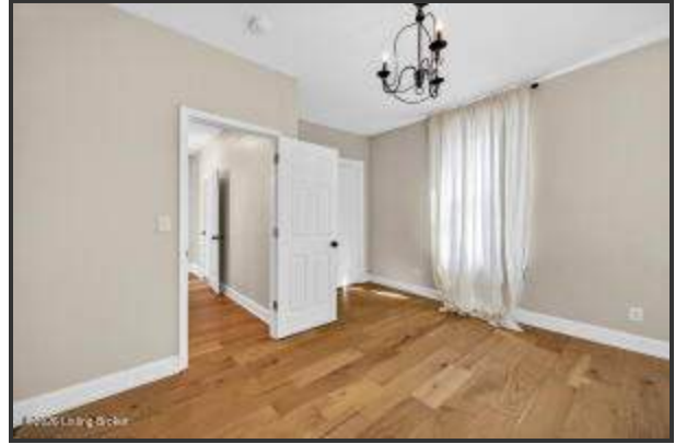
The bedroom features neutral colors and wide-plank hardwood floors