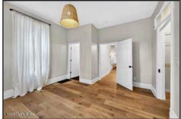
A wicker dome pendant light adds warmth to the suite