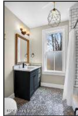
A frosted window allows natural light while maintaining privacy