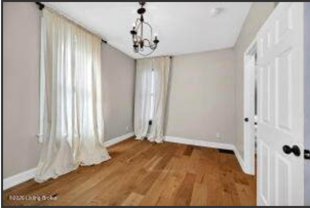
A black iron chandelier adds character to the space and big bright windows