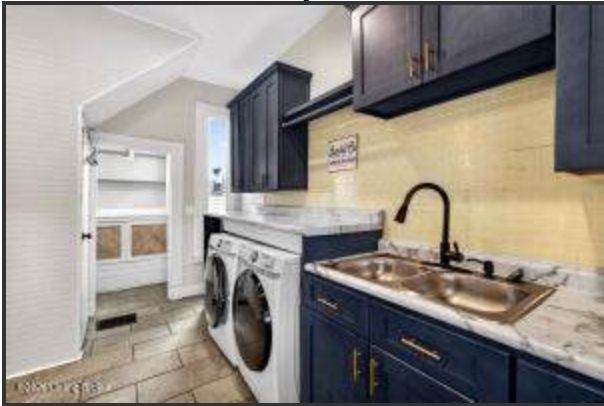
A utility sink provides added functionality