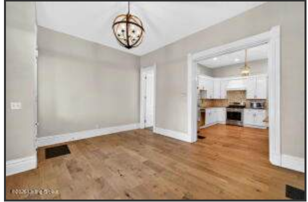
Soaring ceilings with a stunning brass light fixture add warmth and elegance