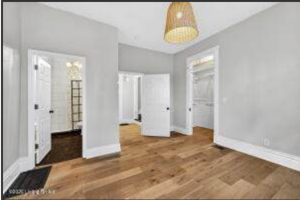
The spacious walk-in closet offers built-in shelving and hanging rods