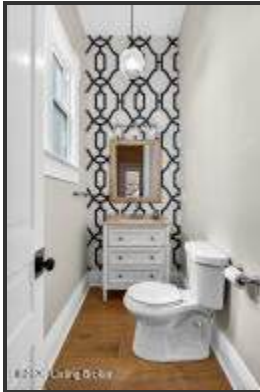
The guest bath features a single vanity with a granite countertop, a framed mirror, and globe hanging and pendant lighting