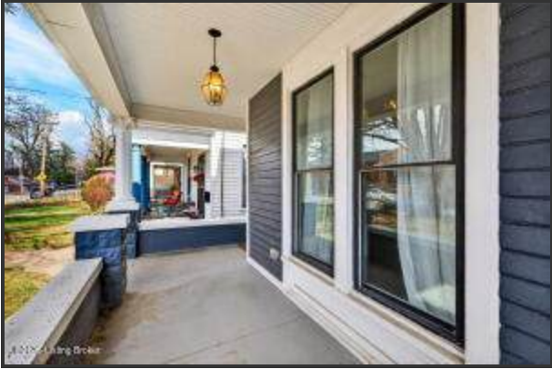
Black-framed windows throughout give the exterior a bold, updated look