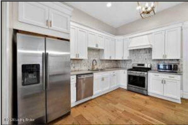
The mosaic tile backsplash pairs beautifully with the countertops