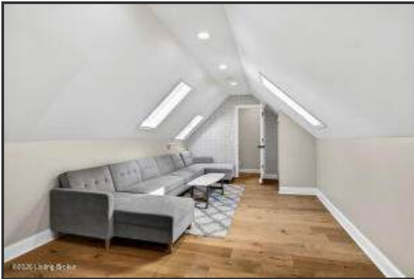
Additional bedroom space could also be used as a home office, playroom, or media room