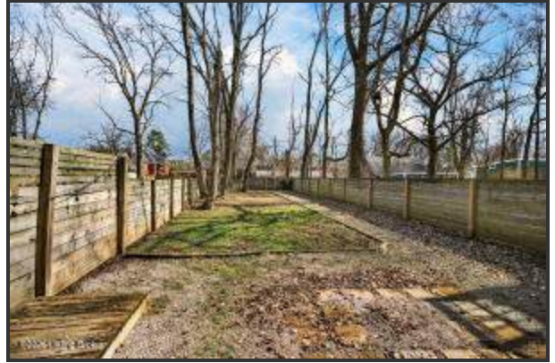
The home is situated on a tree-lined street in one of Louisville's most desirable neighborhoods