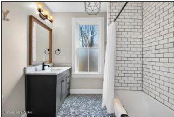
The full bath showcases a single vanity with a marble countertop, wood-framed mirror, and sconce lighting