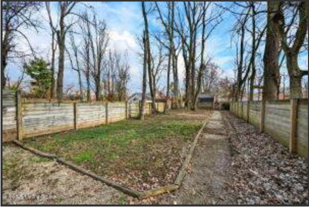
A deep, fully fenced yard features horizontal board privacy fencing