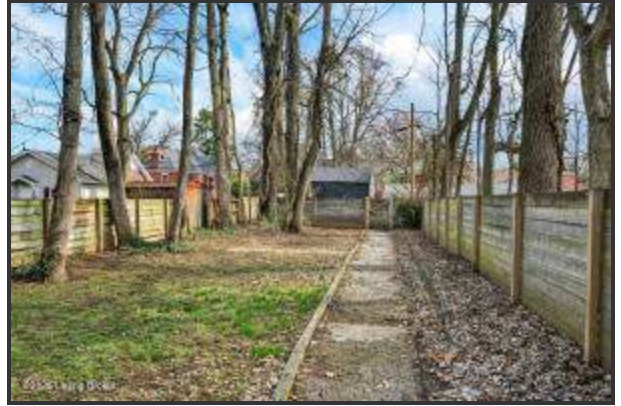
Mature trees provide a natural canopy throughout the property