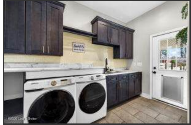
The laundry room hosts navy cabinetry with marble countertops and subway tile backsplash