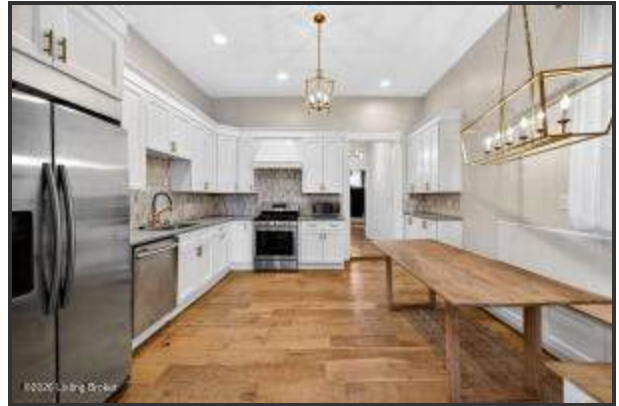
The kitchen provides an abundance of white cabinetry with gold hardware