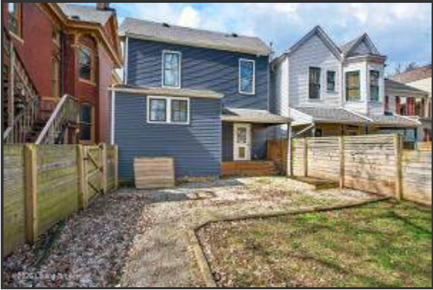
A gated rear entry provides added privacy and convenience