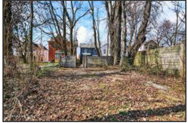
This home is located just minutes from the restaurants, parks, coffee shops, boutiques, and nightlife