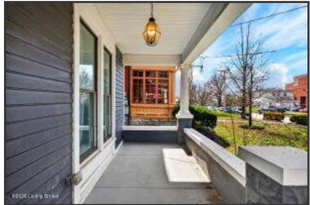
The covered front porch features columns and a lovely glass lantern pendant