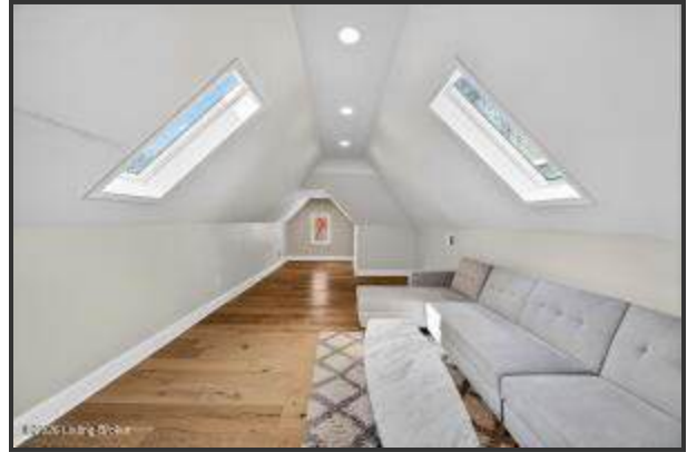
Dual skylights fill the space with natural light