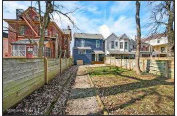
A gravel pathway runs the full length of the yard