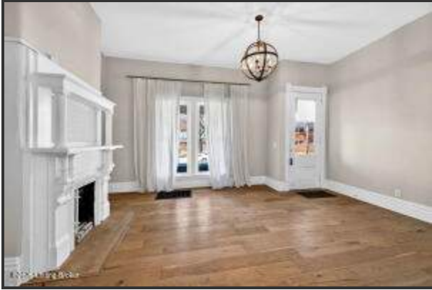
A grand white fireplace with a carved mantel surround serves as the focal point of the room