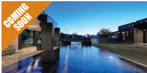
5509 W Softwind Dr