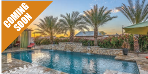
25207 N 71st Ave