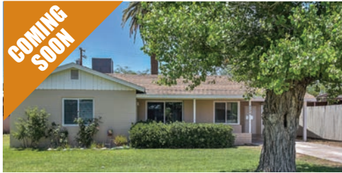
4526 N 18th Dr