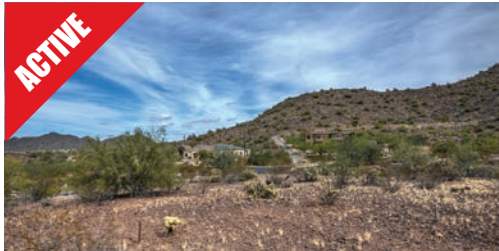
7369 W Brookhart Way Lot 8

Please call TODAY to view one of these homes.