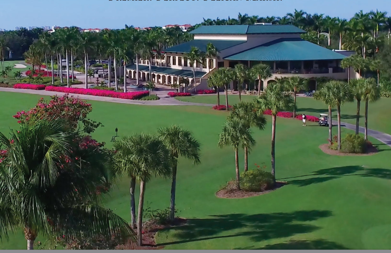
Renowned Golf Course | Superior Service | Remarkable Practice Facility Memorable Social & Dining Experiences