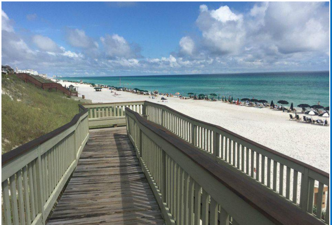
In Rosemary Beach, every wooden walkway leads to the beach (including this one!).

The easiest way to get around is by car, and most visitors drive to South Walton. Parking spots are usually easy to come by (and many towns are in the process of adding more), and traffic is only a real problem on Saturdays, the move-in and move-out day for most rental properties. Avoid 30a and stick to Hwy 98, which also runs the length of South Walton, if you're trying to get somewhere in a hurry. There are rental car agencies in Destin, Panama City Beach, and at the airports, but if you don't have a car and want to avoid renting one, Uber and Lyft are already well established. If you're only based in one or a few towns, South Walton can be easily explored by bike or on foot. Every neighborhood is extremely safe, so while one should always exercise caution when walking around at night, there is no need to avoid staying out past dark.