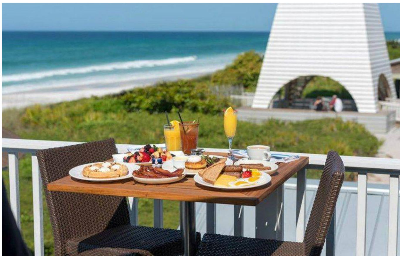
The rooftop at Bud and Alley's, looking out over the Gulf.