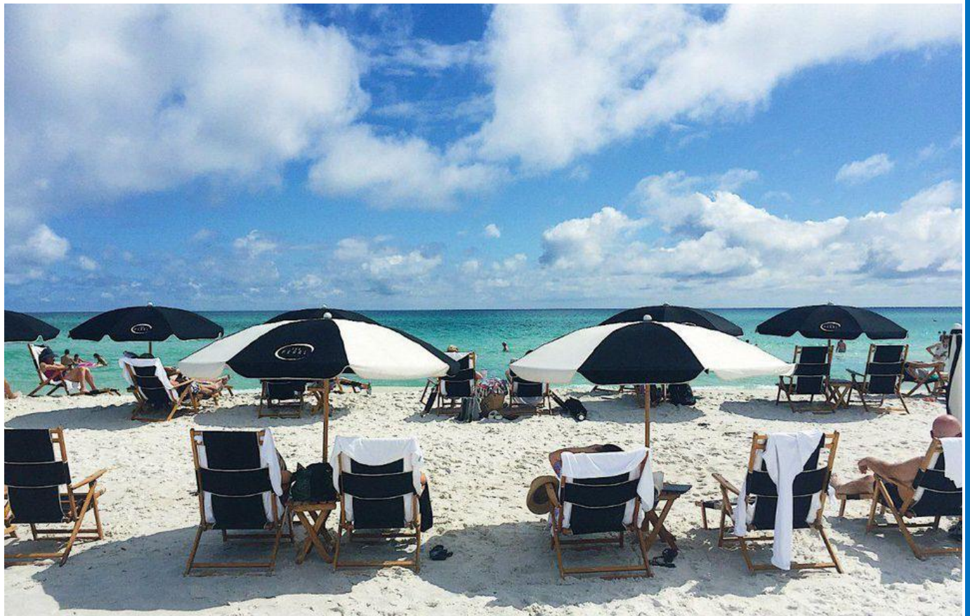
Beach chair and umbrella service, compliments of the Pearl Hotel.

Beach and Pensacola, in the northwest part of the state, it serves as a popular vacation destination for visitors from neighboring Texas, Louisiana, Mississippi, Alabama, Georgia, and Tennessee. The main draw is the 26-mile stretch of white-sand beach along the Emerald Coast, named for the calm, turquoise waters of the Gulf of Mexico that lap South Walton's shores. But that's not all the area has to offer: You'll find exceptional design, a variety of restaurants and shops, outdoor recreation, a thriving art scene, and daily events year-round, drawing families with children of all ages, couples young and old, honeymooners, and bachelorette parties alike.