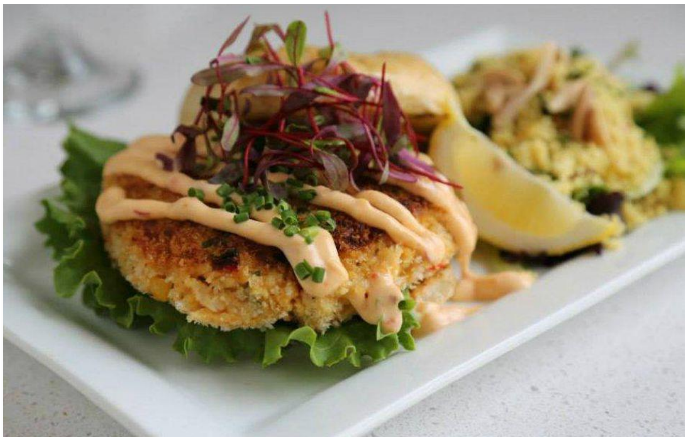
"Misbehaving" at George's.