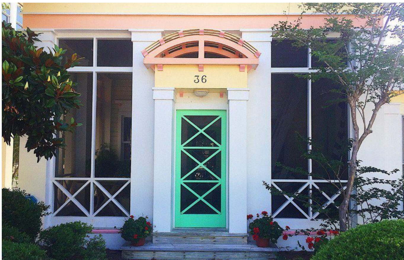
The Truman house, 36 Natchez St., in Seaside.