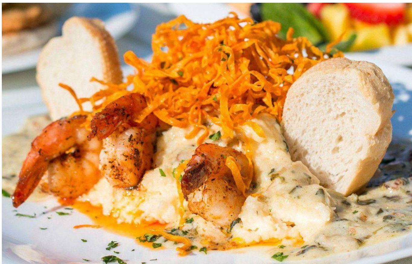
The famous Grits a Ya Ya.