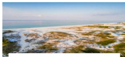
GRAYTON BEACH GRAYTON DUNES