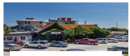
GRAYTON BEACH GRAYTON BEACH RED BAR CAM