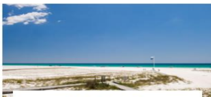
GRAYTON BEACH GRAYTON BEACHCAM