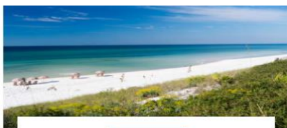
ALYS BEACH ALYS BEACHCAM