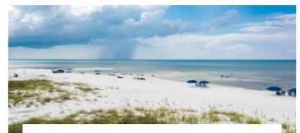
INLET BEACH INLET BEACHCAM