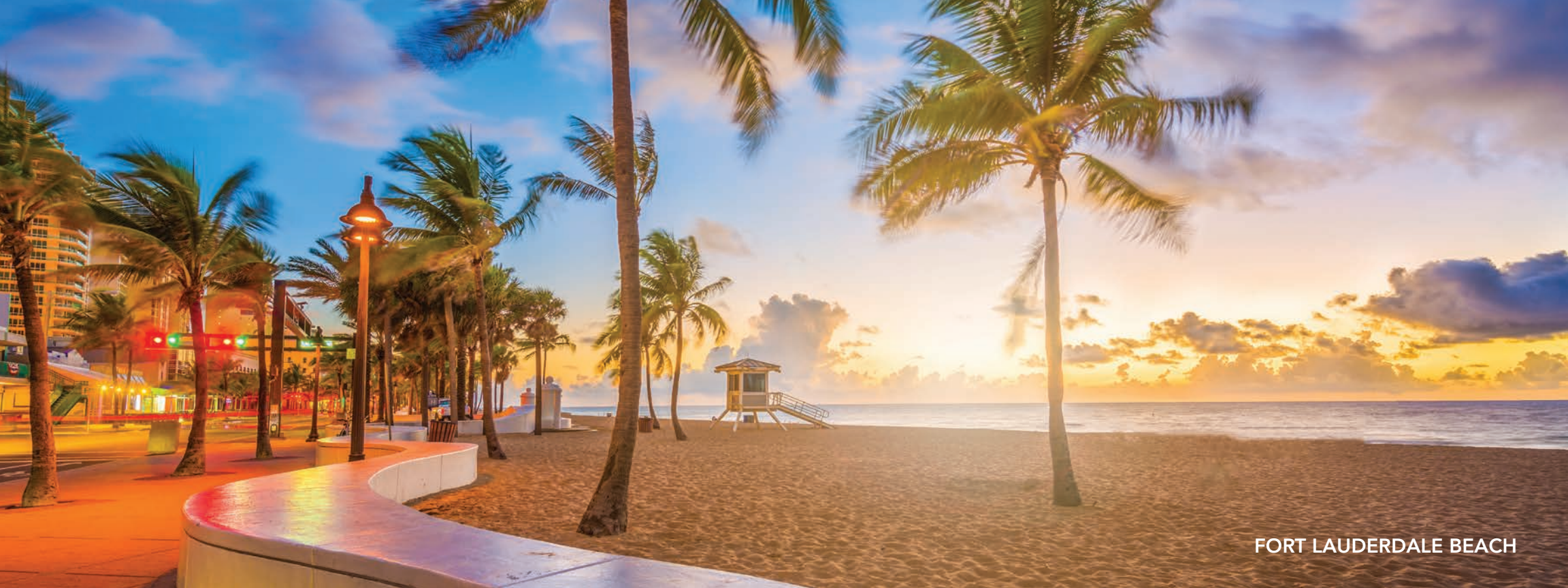
FORT LAUDERDALE BEACH