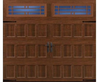
* UPGRADE * WALNUT

* DUE TO COMPUTER MONITOR SETTINGS, COLORS MAY VARY IN REAL LIFE *