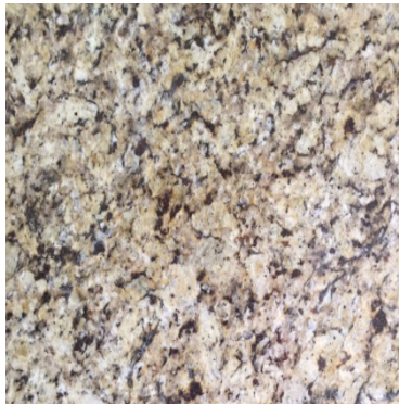
NEW VENETIAN GOLD