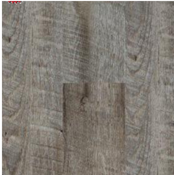
SOUTHWIND- CAPE COD GREY