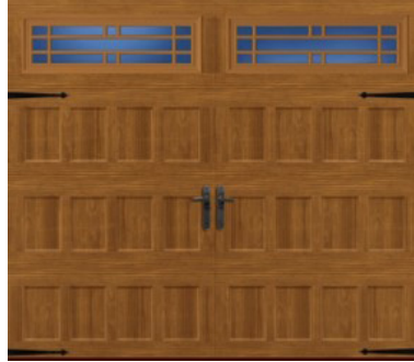
* UPGRADE * GOLDEN OAK