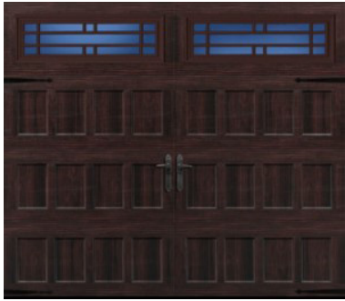
* UPGRADE * MAHOGANY

AMARR CARRIAGE HOUSE OAK SUMMIT RECESSED PANEL DOORS WITH PRAIRIE WINDOWS