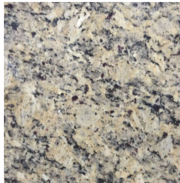
SANTA CELIA LIGHT